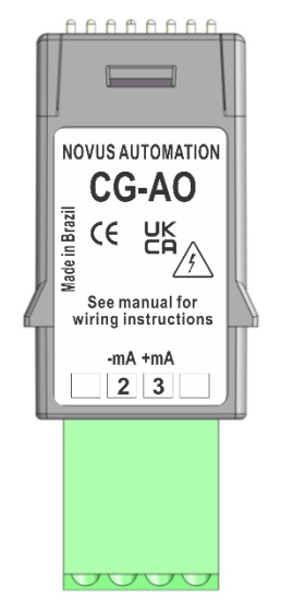
Figure 2 – Electrical connections

CG-AO uses 1 plug-in connector. The figure below shows the laser engraving with the electrical connections of this module: